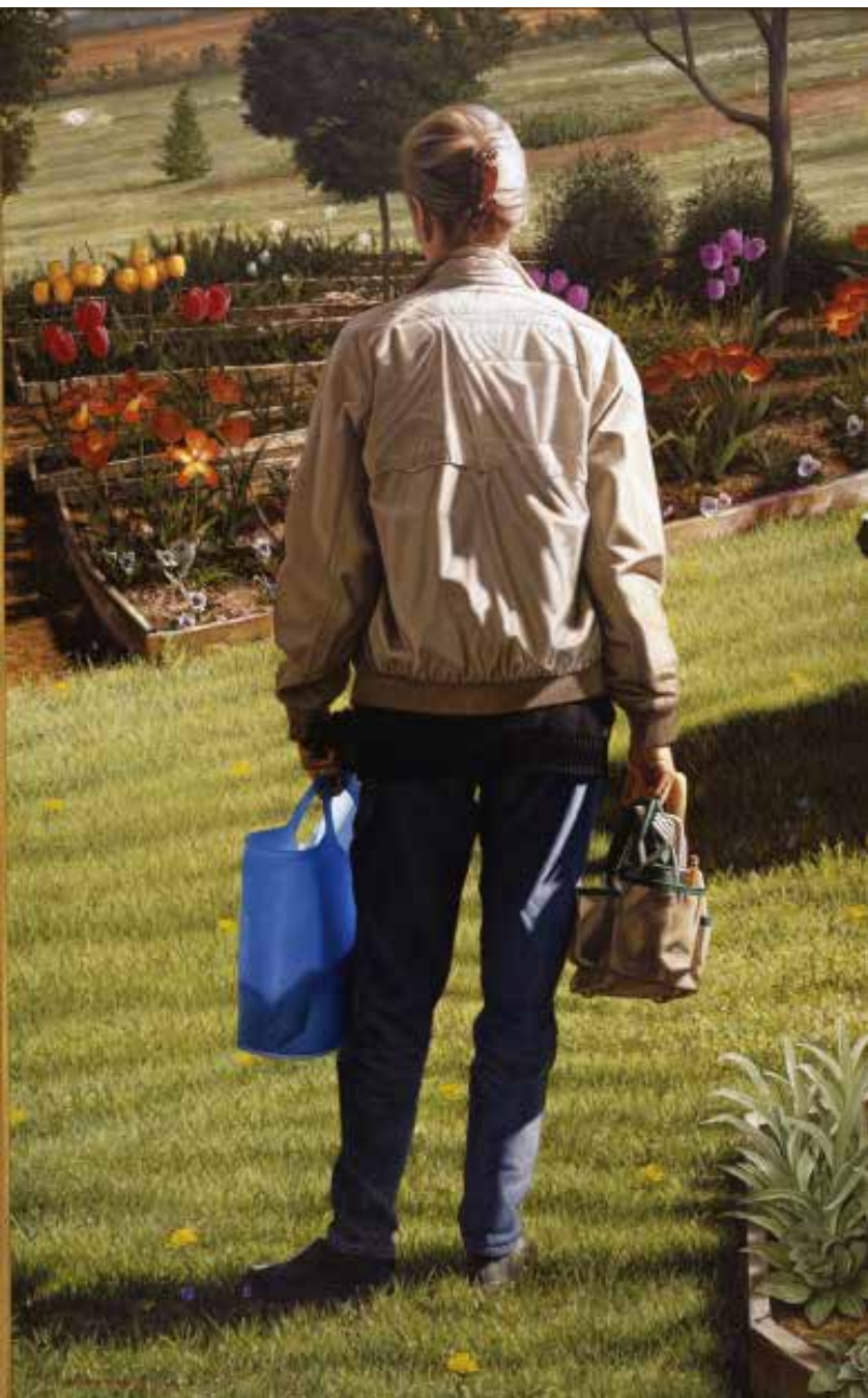
Stone Roberts (b. 1951) Garden 2002, Oil on linen, 60 1/4 x 37 3/4 in. Hirschl and Adler Galleries, New York City