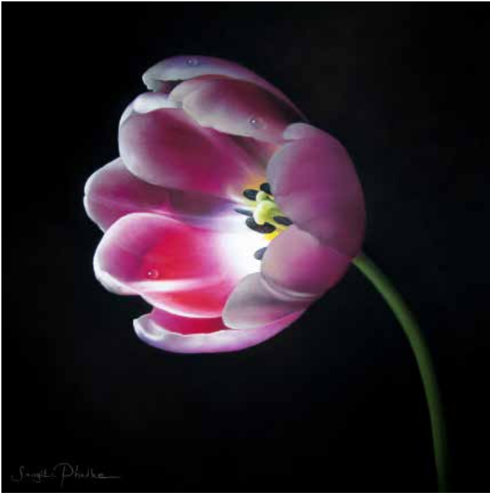
Sangita Phadke (b. 1982) A Tulip in Bloom 2013, Pastel on paper, 21 x 21 in. On view June 3-16 at Waxlander Gallery, Santa Fe