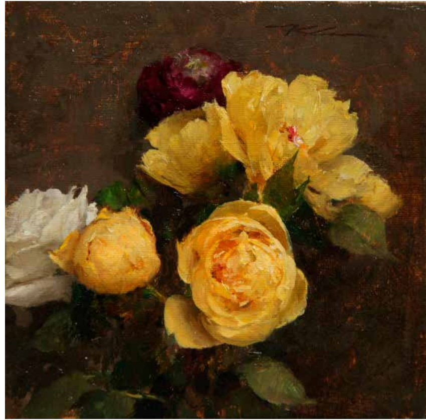
Michael Klein (b. 1980) Yellow Peonies 2014, Oil on linen on panel, 6 x 6 in. Collins Galleries, Orleans, Massachusetts