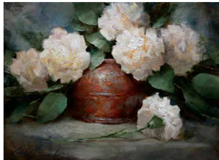
Justin Clements (b. 1980) White and Bronze 2014, Oil on panel, 12 x 16 in. Private collection