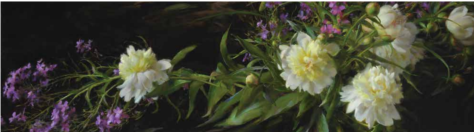
Rose Frantzen (b. 1965) Peonies and Phlox 2013, Oil on panel, 11 x 40 in. Private collection